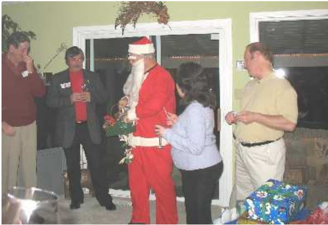
Santa distributes presents. No lumps of coal for our wonderful club members!