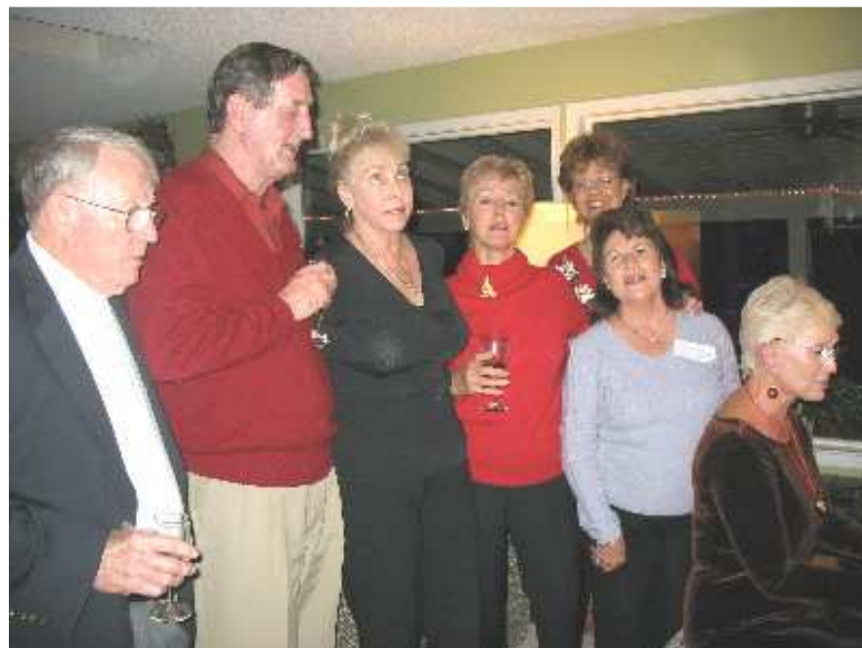
Good company, good music and good cheer! Here's to a Merry Christmas for our members and friends!